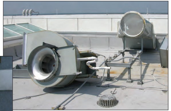
Figure 8. The equipment on this stand was resting on vibration isolators that provided lateral resistance but no uplift resistance (above). A damaged vibration isolator is shown in the inset (left).