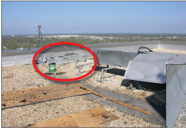
Figure 5. Two large openings remained (circled area and inset to the right) after the ductwork on this roof blew away.

For larger cowlings, use 3/16-inch diameter cables. When the basic wind speed is 120 mph or less, specify two cables. Where the basic wind speed is greater than 120 mph, specify four cables. To minimize leakage potential at the anchor point, it is recommended that the cables be adequately anchored to the equipment curb (rather than anchored to the roof deck). The attachment of the curb itself also needs to be designed and specified.