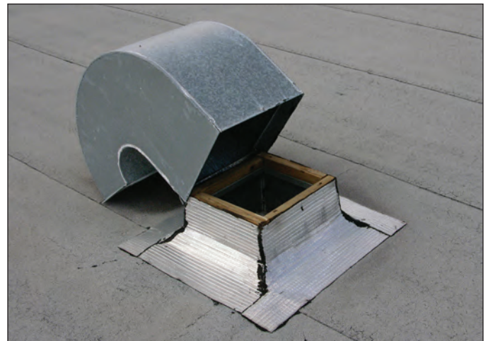
Figure 1. This gooseneck was attached with only two small screws. A substantial amount of water was able to enter the building during the hurricane.

Simplified Attachment Table: To anchor fans, small HVAC units, and relief air hoods, the following minimum attachment schedule is recommended (see Table 1) (note: the attachment of the curb to the roof deck also needs to be designed to resist the design loads):