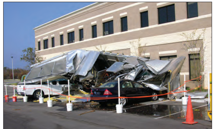
Figure 2. This 30' x 10' x 8' 18,000-pound HVAC unit was attached to its curb with 16 straps (one screw per strap). Although the wind speeds were estimated to be only 85 to 95 miles per hour (3-second peak gust), it blew off the building.