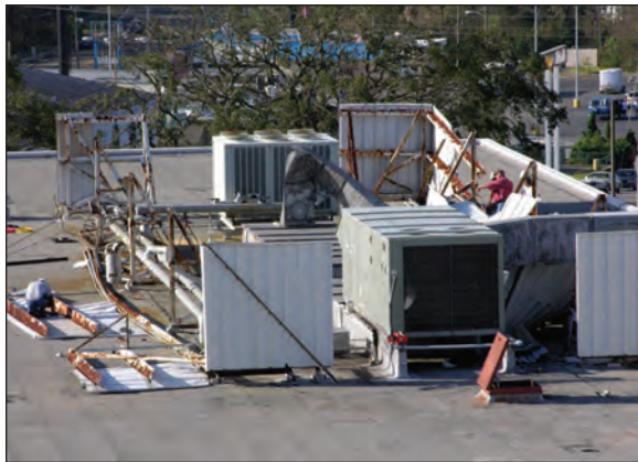
Figure 9. Several of the equipment screen panels were blown away. Loose panels can break glazing and puncture roof membranes.

Equipment Screens: Equipment screens around rooftop equipment are frequently blown away (see Figure 9). Equipment screens should be designed to resist the wind loads derived from ASCE 7.