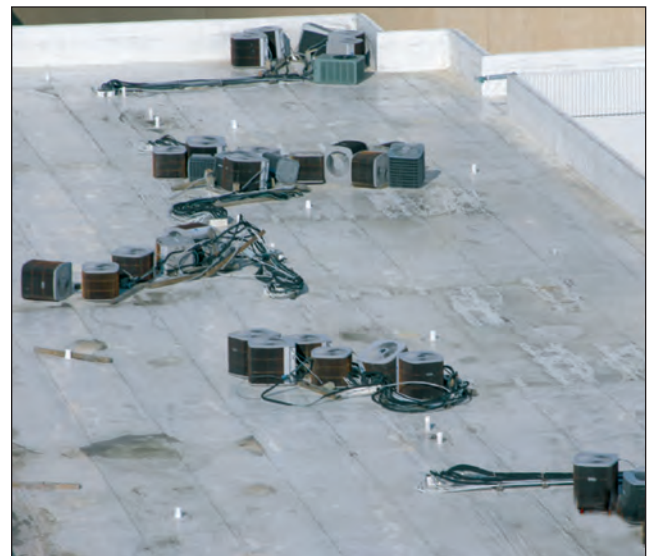
Figure 6. Sleeper-mounted condensers displaced by high winds.

Condensers: In lieu of placing rooftop-mounted condensers on wood sleepers resting on the roof (see Figure 6), it is recommended that condensers be anchored to equipment stands. (Note: the attachment of the stand to the roof deck also needs to be designed to resist the design loads.) In addition to anchoring the base of the condenser to the stand, two metal straps with two side-by-side #14 screws or bolts at each strap end are recommended (see Figure 7).