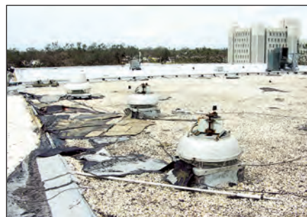
Figure 3. Cowlings blew off two of the three fans shown in this photo. Cowlings can tear roof membranes and break glazing.

Fan Cowling Attachment: Fans are frequently blown off their curbs because they are poorly attached. When fans are well attached, the cowlings frequently blow off (see Figure 3). Unless the fan manufacturer specifically engineered the cowling attachment to resist the design wind load, cable tie-downs (see Figure 4) are recommended to avoid cowling blow-off. For fan cowlings less than 4 feet in diameter, 1/8-inch diameter stainless steel cables are recommended.