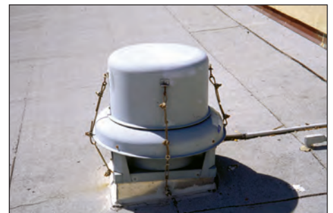
Figure 4. To overcome blow-off of the fan cowling, this cowling was attached to the curb with cables.